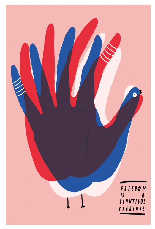
Daniela Yankova for Fine Acts @shadowchaser

If your audience sees an intractable problem, it risks becoming a new normal, an unfortunate but accepted reference point for how things are. Our challenge is to show how human decisions created the problem and how different choices can fix it We need the courage to promote intelligent solutions, using communications to shift them from radical ideas to common sense. You can oppose austerity, but policies will not change until the public believes public spending actually works. Talking about solutions is hard in the midst of dire crises, but the darkest times may be the moments where people most need a path towards the light.