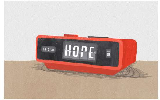
Safwat Saleem for Fine Acts @safwtf