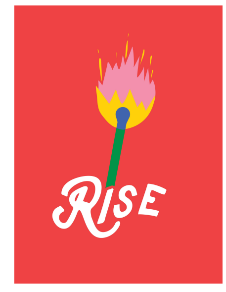
Safwat Saleem for Fine Acts @safwtf

Civil society needs to move on from tactics based on shocking audiences with the scale of abuses and suffering. We must cultivate passion and determination to achieve positive change.